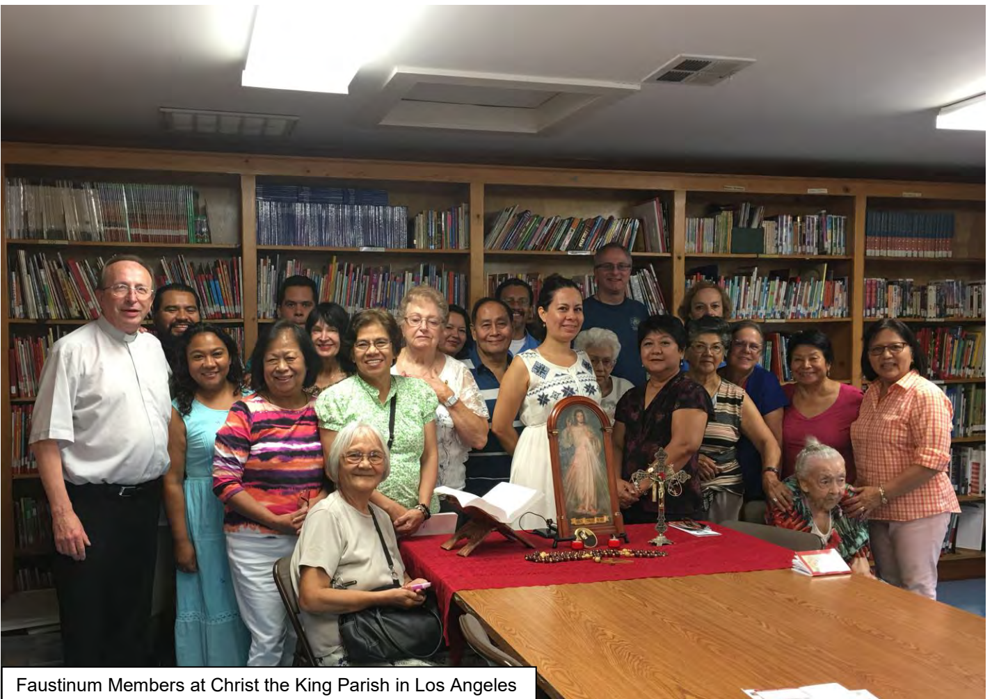
Faustinum Members at Christ the King Parish in Los Angeles