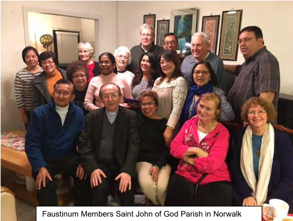
Faustinum Members Saint John of God Parish in Norwalk

This fire of mercy needs to be passed on to the world. In the mercy of God the world will find peace and mankind will find happiness! I entrust this task to you, dear Brothers and Sisters, [...] and to all the votaries of Divine Mercy. May you be witnesses to mercy! (Saint John Paul II)