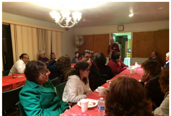
Spanish speaking Faustinum Members in Norwalk